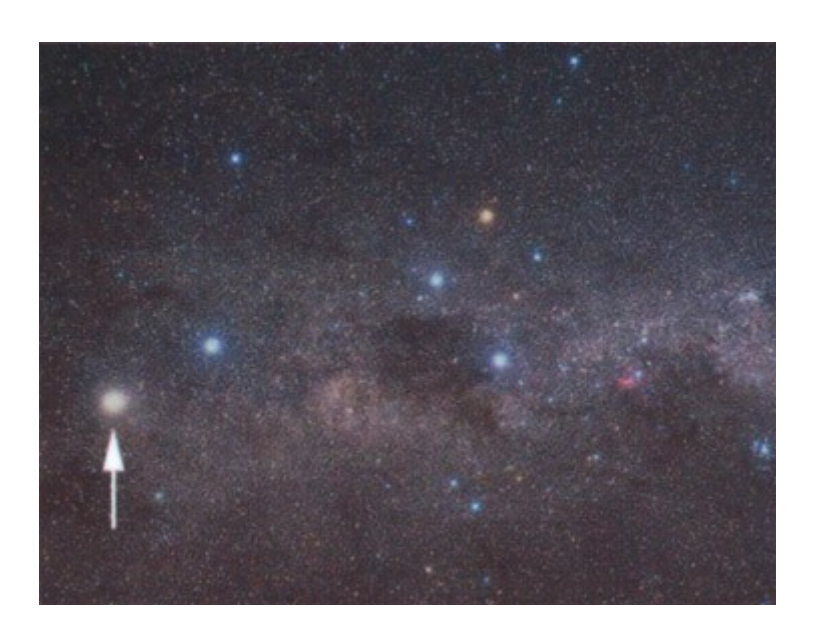
Alpha Centauri is the brightest star in the constellation Centaurus

Distance: 4.4 light years/1.4 parsecs Apparent Magnitude: 0.0 Absolute Magnitude: +4.3 Spectral Class: G2 Yellow Dwarf Optimum Visibility: May