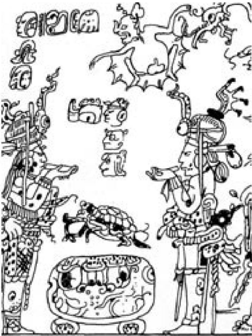
Mayan Hero Twins. Drawing after a Mayan vase depicting the Hero Twins, Hunahpu and Xbalanque, whose resourcefulness helped them to vanquish the Xibalba lords. The bat hovering overhead recalls their ordeal in the House of Bats, where Hunahpu was decapitated

infant mortality, and the combination of warfare and sacrificial rituals made death an ever-present reality in their everyday life. Much of Mayan ritual and art was dedicated to posthumous existence, from the soul's entrance into the Underworld, Xibalba, to a final rebirth and apotheosis. Mayan mythology and funerary art described death as an intricate journey. Its important stages and challenges were depicted on coffins, wall paintings, pottery, jades, and other objects, which accompanied the deceased during the great transition.