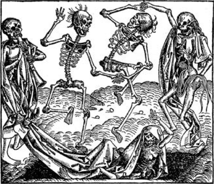
Dance of death. Pictures from La dance macabre des hommes (the Dance of Death of Men), printed by Guyot Marchant, Paris, 1486. Scenes from La dance macabre des femmes (the Dance of Death of Women), printed by Antoine Verard, Paris, 1486. See: Lehner, E. and Lehner, J.: Devils, Demons, Death, and Damnation . Dover Publications, New York City, 1971. Fig. 134, 135, 136 and 137. (BW)

Holbein the Younger from the first half of the fifteenth century is another famous series of powerful illustrations depicting various themes of Ars moriendi .