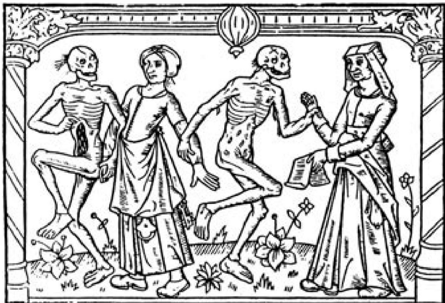
Bride and prostitute. From La dance macabre des femmes (The Dance of Death of Women), printed by Antoine Verard, Paris, 1486. See: Lehner, E. and Lehner, J.: Devils, Demons, Death, and Damnation . Dover Publications, New York City, 1971. Fig. 134, 135, 136 and 137. (BW)