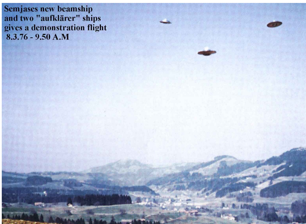
Semjases new beamship and two "aufklärer" ships gives a demonstration flight 8.3.76 - 9.50 A.M