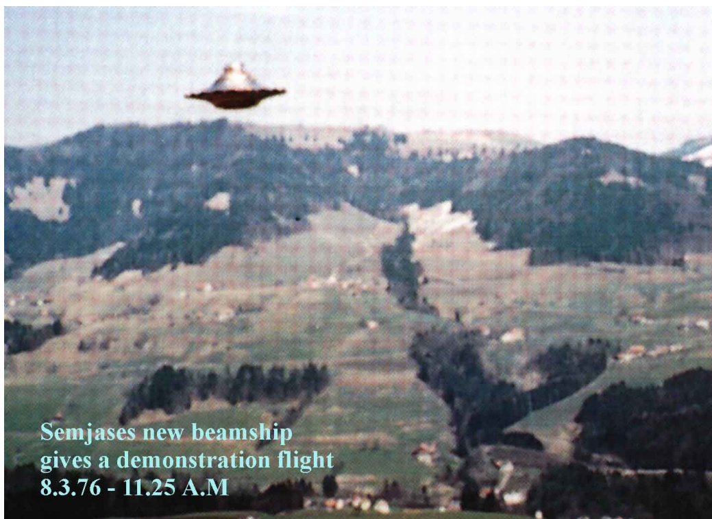
Semjases new beamship gives a demonstration flight 8.3.76 - 11.25 A.M